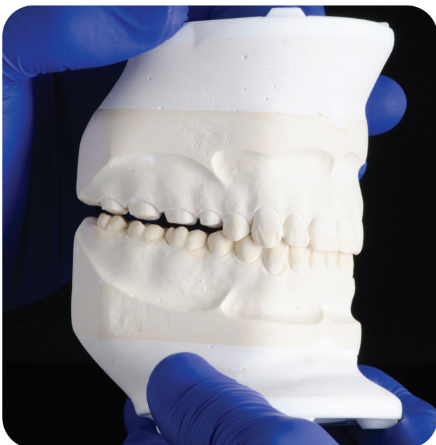
3. Selectively prep patient teeth one quadrant at a time