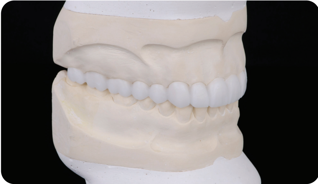
1. Lab fabricated diagnostic wax-up

Prior to the prepping appointment, request the lab fabricate a diagnostic wax-up.