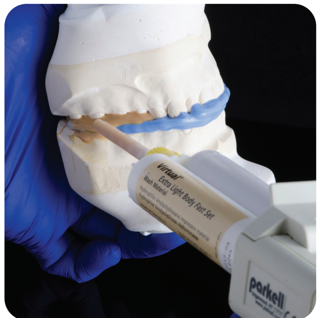
4. Reline the bite at the preps using light body impression material