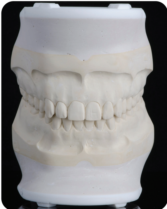
7. Send lab pre-op impression or study models (Photographed are lab mounted study models)