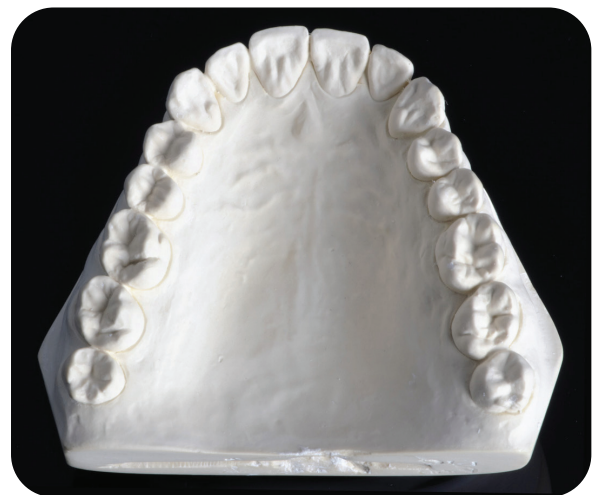
8. Make sure upper impression captures palate in case palatal bite transfer is needed