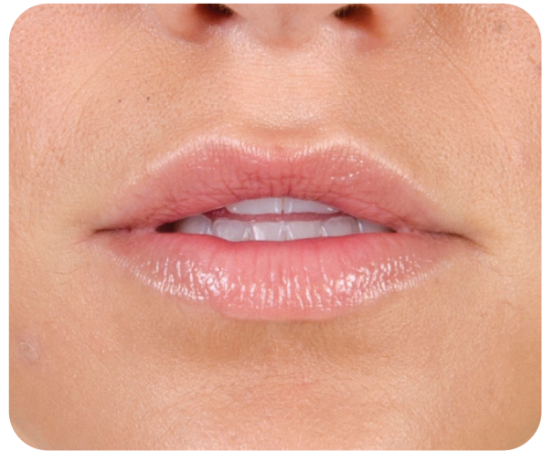
6. Close-up with lips in repose