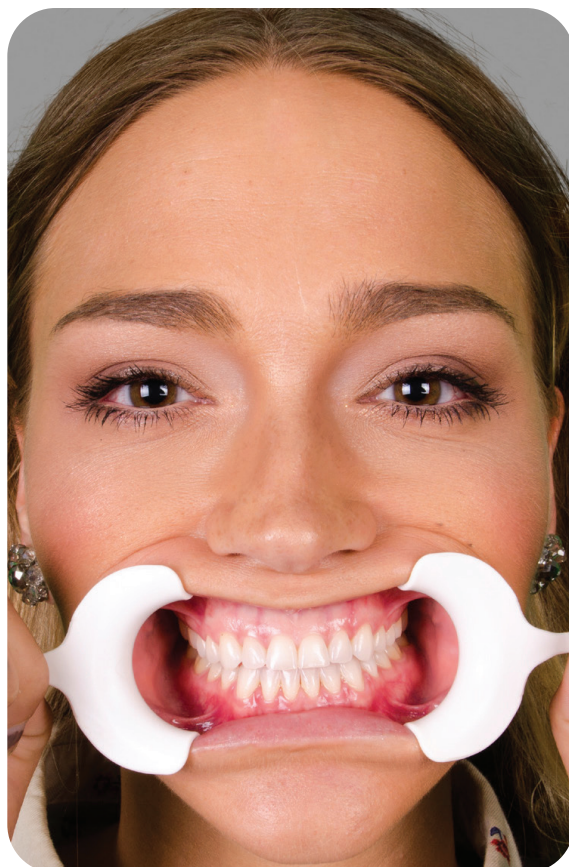
2. Full-face retracted