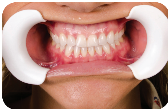
4. Close-up retracted