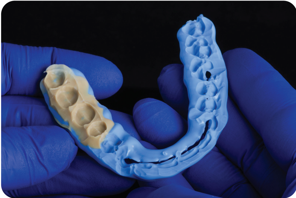
5. Photo shows a properly relined bite with undercuts removed