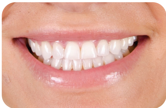
3. Close-up smiling