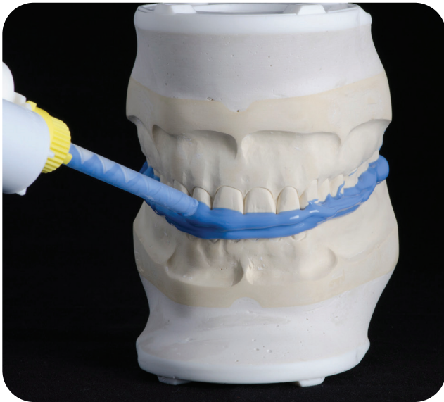
1. Take a full arch pre-op bite of the patient in maximum intercuspation

*Note: The following photos represent clinical bite registrations taken on a patient, NOT on a model.