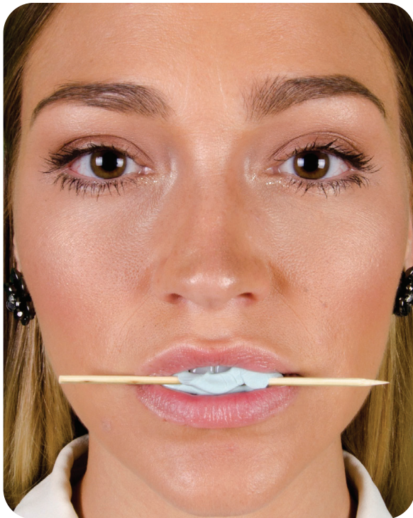
5. Stick bite full face