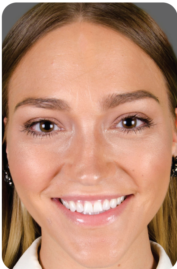
1. Full-face smiling

Prior to beginning a large restorative case, send the following photos to the lab.