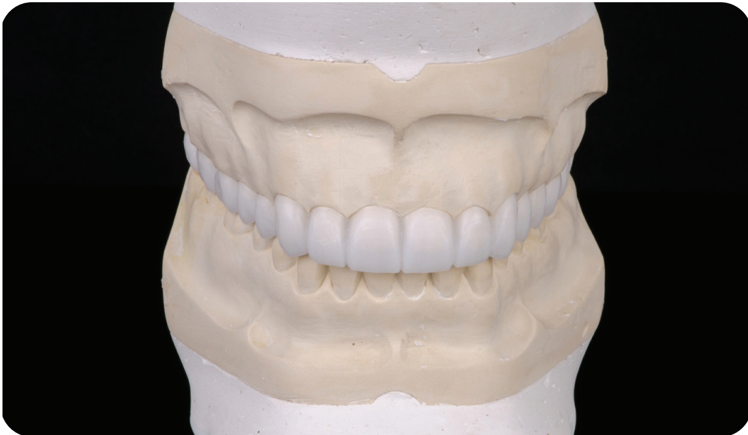
2. Once the patient approves the wax-up, utilize the wax-up to fabricate patient temporaries or request lab fabricated temporaries