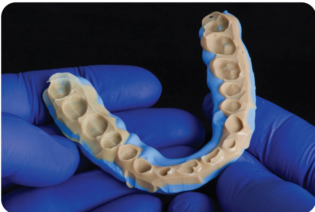
6. Continue prepping and relining until the full arch has been completed